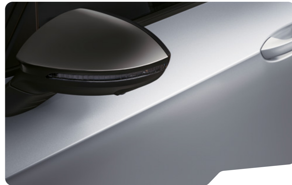
↓ GLACIAL WHITE 2