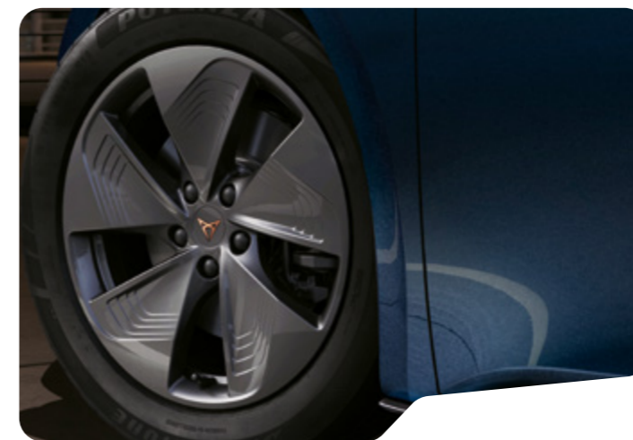
↑ 18" CYCLONE Standard

Our global range of cars and product specifications varies from country to country. Please, visit your local CUPRA website to know more about the product offer available for you.