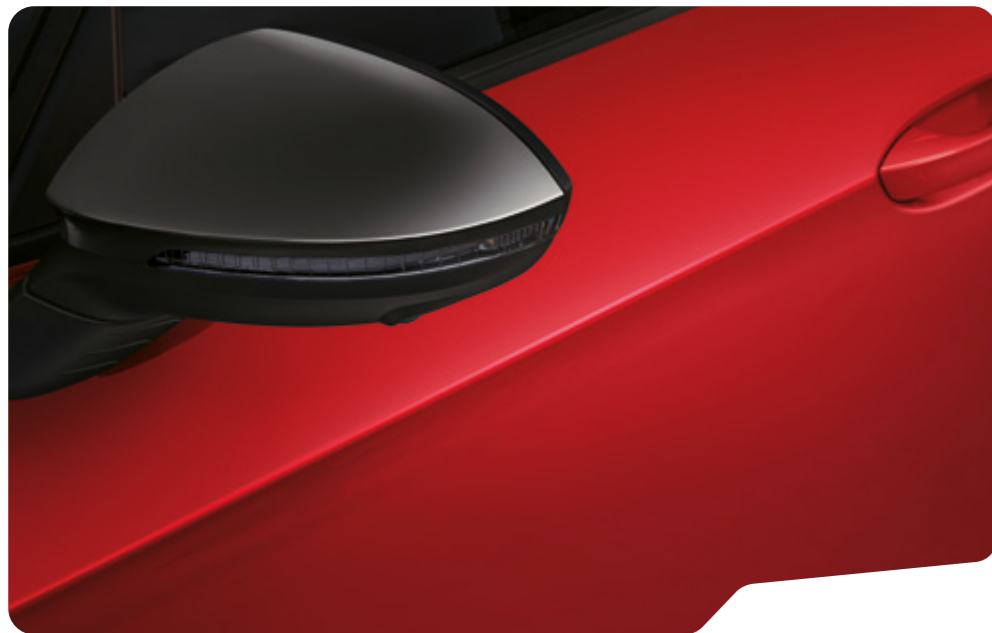
↓ RAYLEIGH RED 2